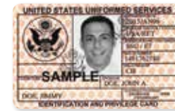
PHOTO ID CARD ISSUED BY THE UNITED STATES