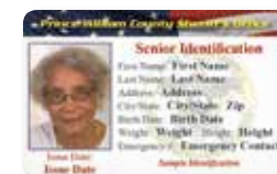
PHOTO ID CARD ISSUED BY A LOCAL VIRGINIA GOVERNMENT