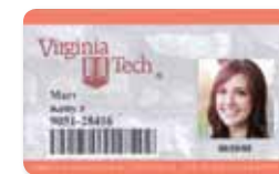
STUDENT PHOTO ID FROM A VIRGINIA COLLEGE OR UNIVERSITY

We've got you covered! You can apply for a FREE Virginia Voter Photo ID card from any local Virginia voter registration office throughout the year, even on Election Day. Once you complete and sign the application, your Virginia Voter Photo ID card will be mailed to your address on file in the Voter Registration System, which takes approximately two to four weeks. You may be eligible to receive a Temporary Identification Document to use in the election while your permanent ID card is processed through the mail.