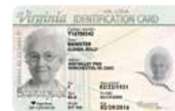
PHOTO ID CARD ISSUED BY THE COMMONWEALTH OF VIRGINIA