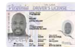
VIRGINIA DMV-ISSUED DRIVER'S LICENSE

Acceptable forms of photo ID include Virginia DMV-issued photo IDs and driver's licenses; U.S. Passports; employer-issued photo IDs; student photo IDs from a school, college or university located in Virginia; photo ID cards issued by the United States, the Commonwealth of Virginia, or a local Virginia government; and Virginia Voter Photo ID cards. All of the acceptable forms of photo ID can be used for voting up to a year after the ID has expired.