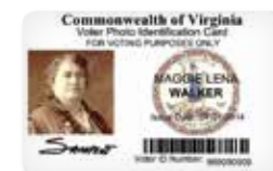
FREE VIRGINIA VOTER PHOTO ID CARD

Don't worry! You can still vote a provisional ballot in your precinct. If you vote a provisional ballot, you will have until noon on the Friday following the election to either drop-off, mail, email or fax a copy of your acceptable photo ID or you can apply for a FREE Voter Photo Identification card in your voter registration office. You will immediately receive a Temporary Identification Document that can be submitted to have your ballot counted.