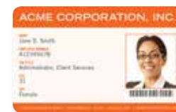
EMPLOYER-ISSUED PHOTO ID